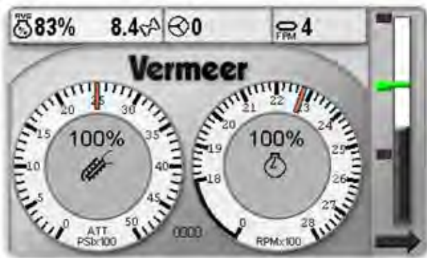
CLEANER DASH DISPLAY. Shows the operator the status of the most critical elements of machine performance.

SMARTTEC PERFORMANCE SOFTWARE helps maximize machine performance by assisting operators with adjustments to machine controls, and monitoring and recording machine performance for future analysis by the machine owner or fleet manager.