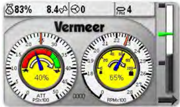
OPTIMIZE PERFORMANCE. Yellow operator prompts provide visual cues to the operator for recommended control adjustment.